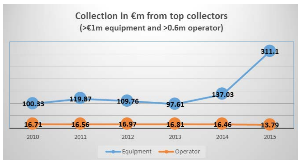
Figure 2: Collections (in million euros) from top collectors (>€1m Equipment and >€0.6m Operator)

The final column of Table 16 shows huge variations in per capita levy collections in the levy countries. The lowest figure is 0.002 euros in Burkina Faso, followed by about 2 cents per capita in Croatia, Lithuania and Ghana, although it should be noted that the levies in Croatia and Ghana have only been partially implemented. The highest figure of 3.50 euros per capita in Germany results from the inflation of German collections by collections for the past (see page 105). The next highest figure is 2.18 euros for Belgium.